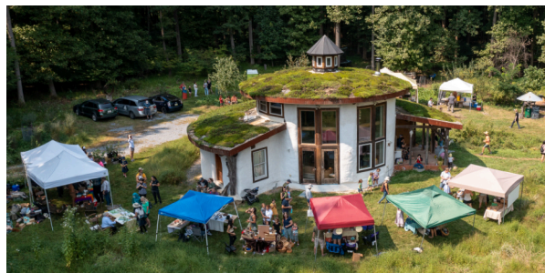
Below: The Judd Homestead during PawPaw Fest